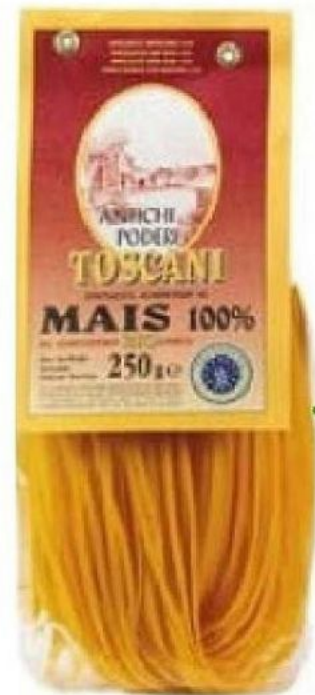
7120 Кукуруза Лингвини Corn Linguine / gr. 250 - box C - 16 pz.