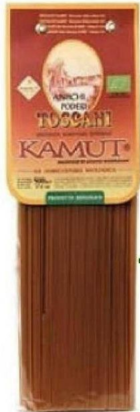
31206 100% Камут спагетти 100% Kamut Spaghetti / gr. 500 - Box F - 12 pz.