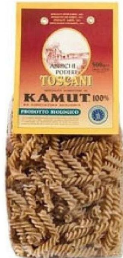
31140 Камут фузилли Fusilli with Kamut / gr. 250 - box C - 16 pz.