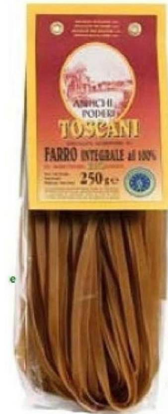
8122 Написание Тальятелле Spelt Tagliatelle / gr. 250 - box B - 16 pz.